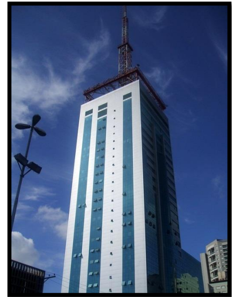
UNIP New Campus Center