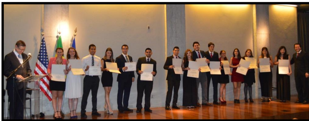
Part of the August group class 2013 during the Graduation Ceremony