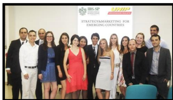
January group class 2013 at UNIP building