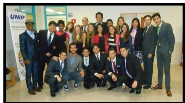
July group class 2013 at UNIP building

If you want to know our students' opinion about the program, visit: